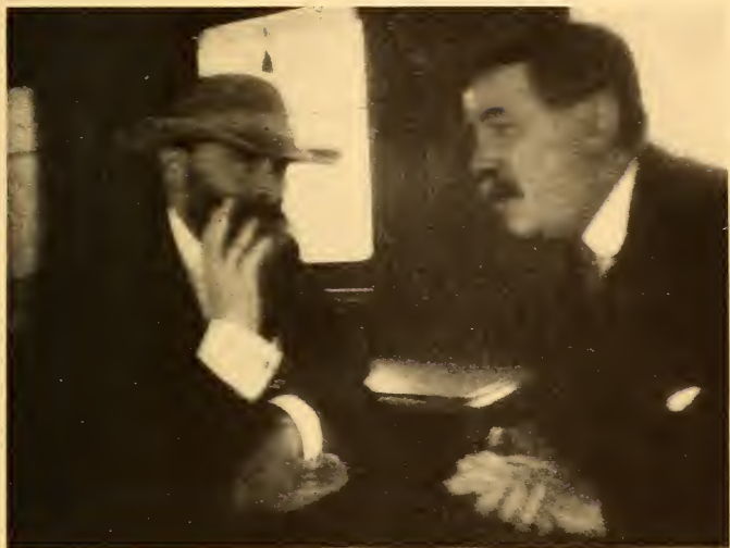
JOSEPH PULITZER IN 1906, TAKEN ON THE TRAIN BETWEEN LONDON AND DOVER